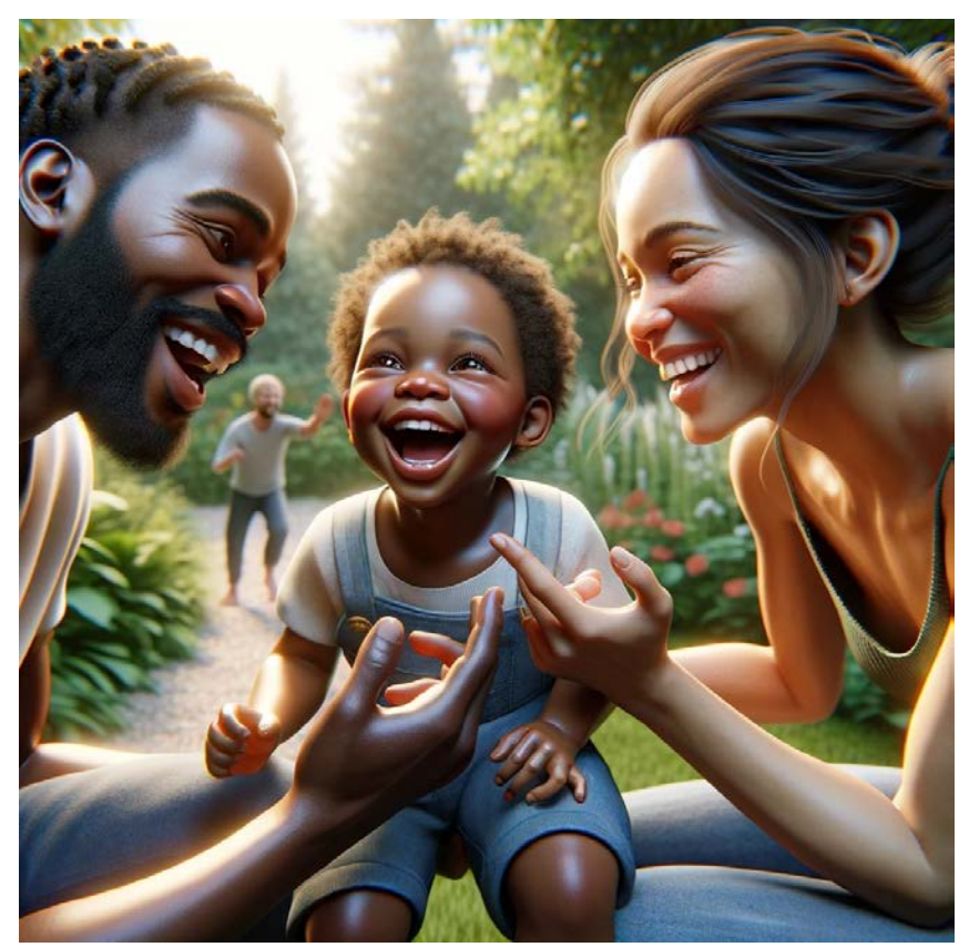
The joy of a securely attached child is mirrored by the parents who take joy in his accomplishments and development.

what I look for to mirror. I didn't develop much mirroring for the good feelings.